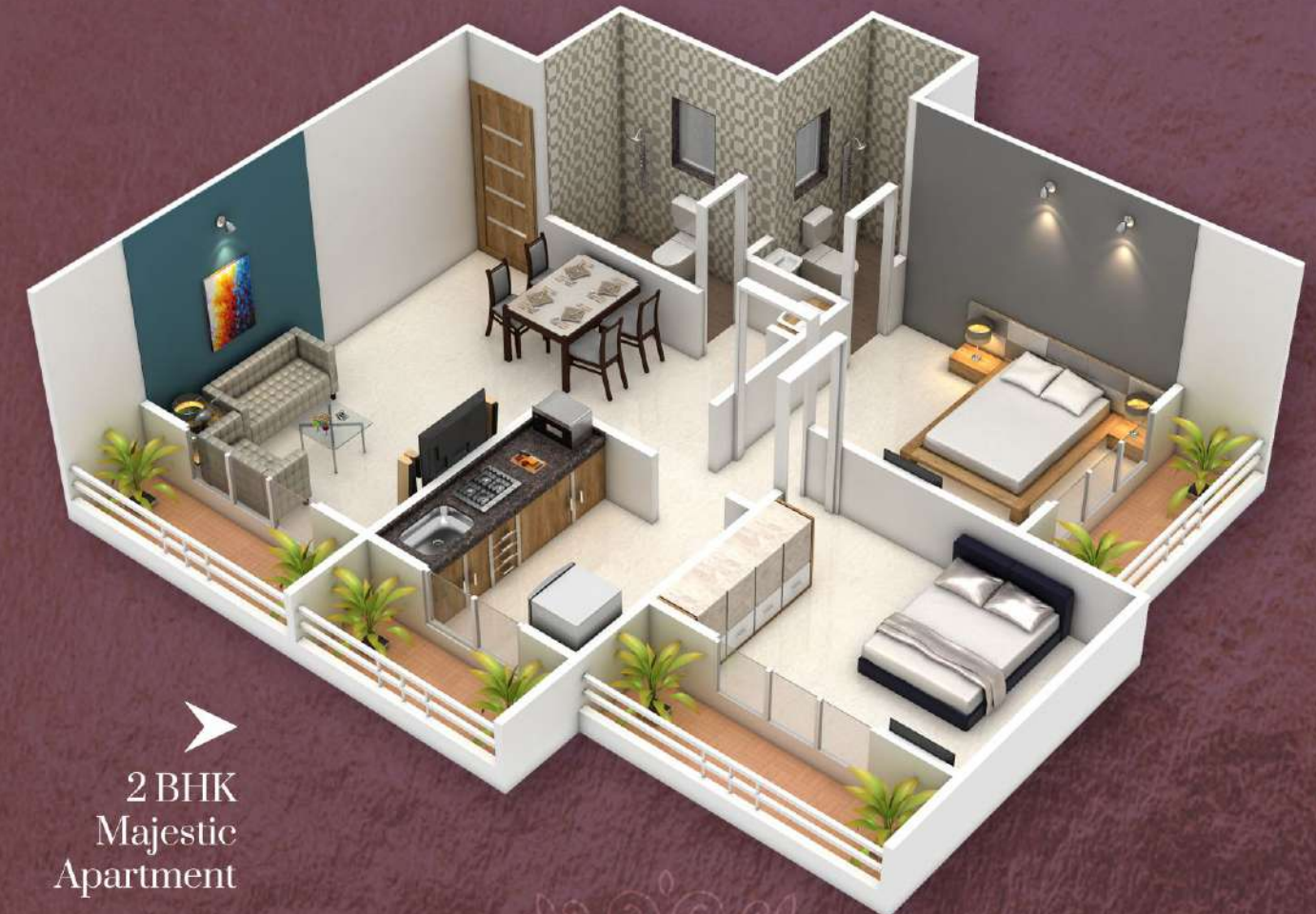
2 BHK Majestic Apartment

Image are for visual representation only.