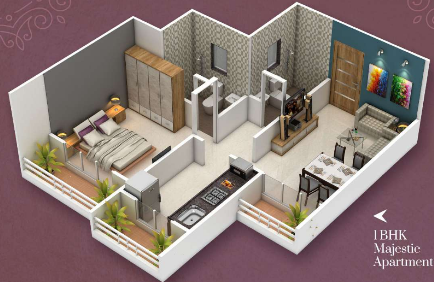
1 BHK Majestic Apartment

Stock images are for representative purpose only.