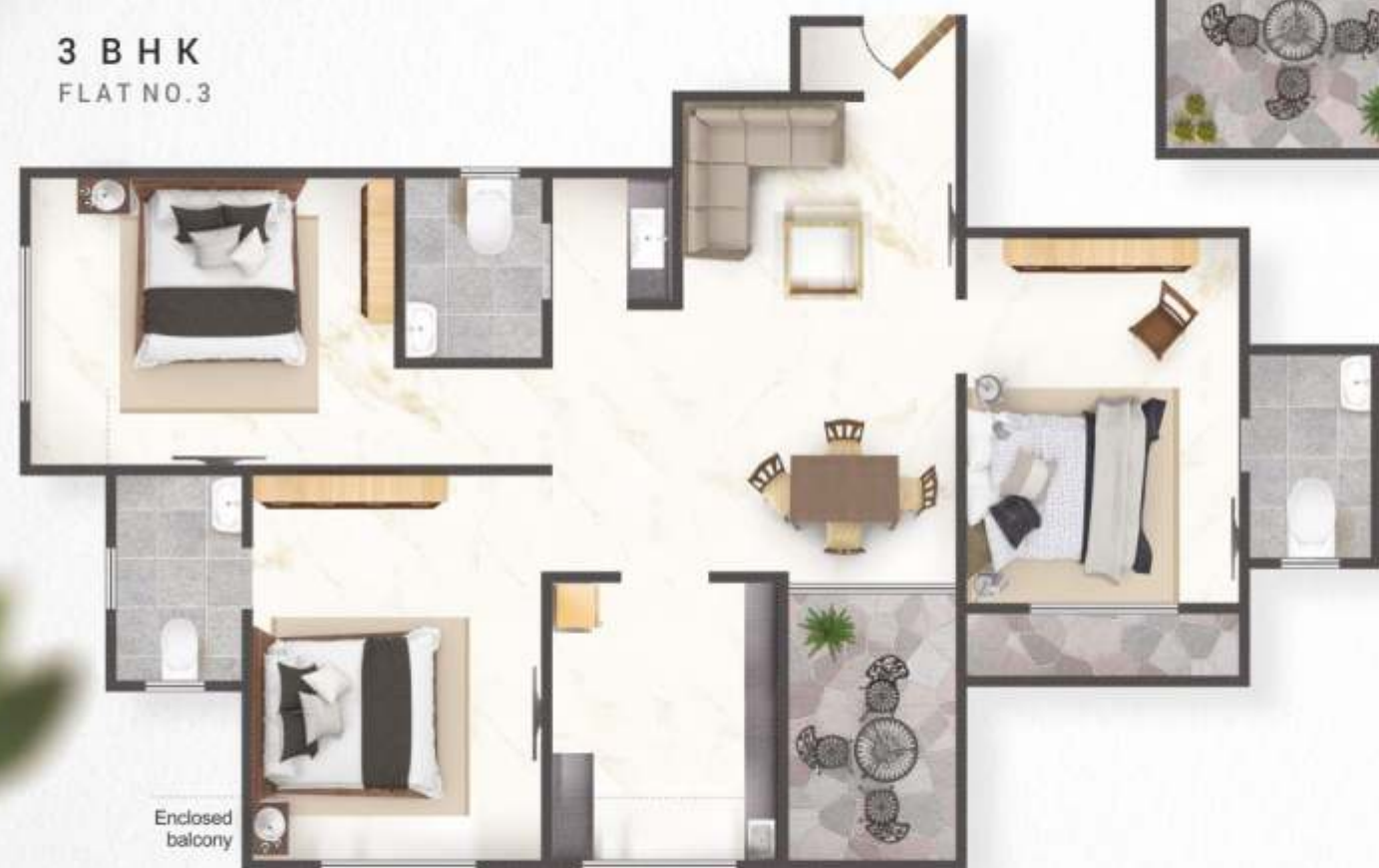
3 BHK FLAT NO.3