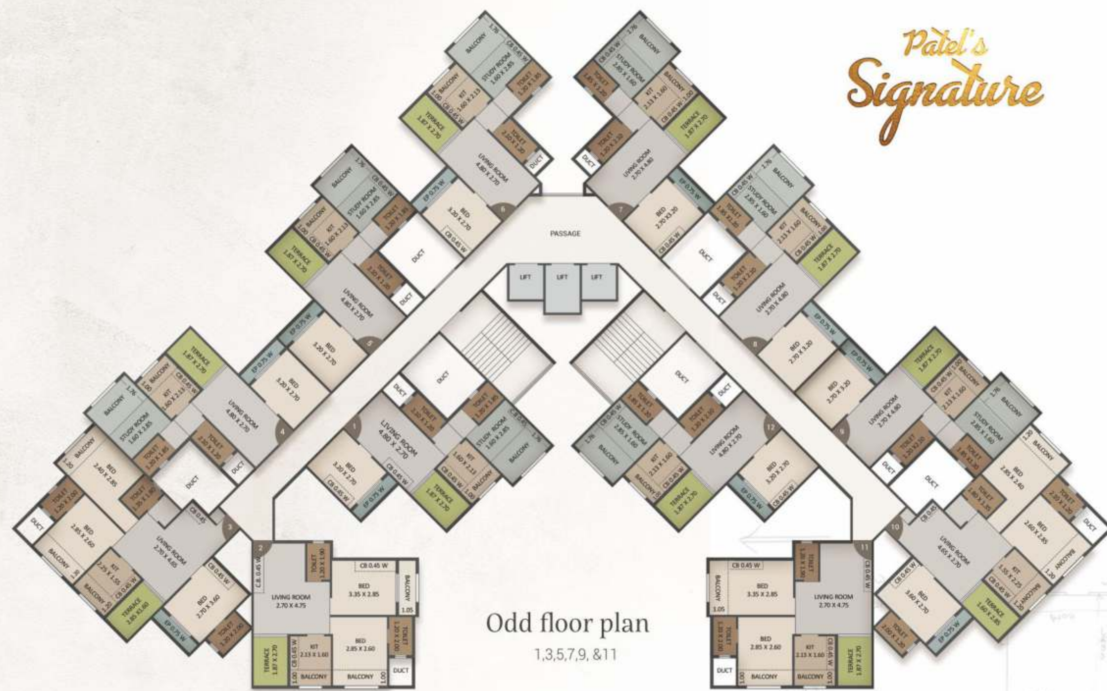
Odd floor plan 1,3,5,7,9 & 11