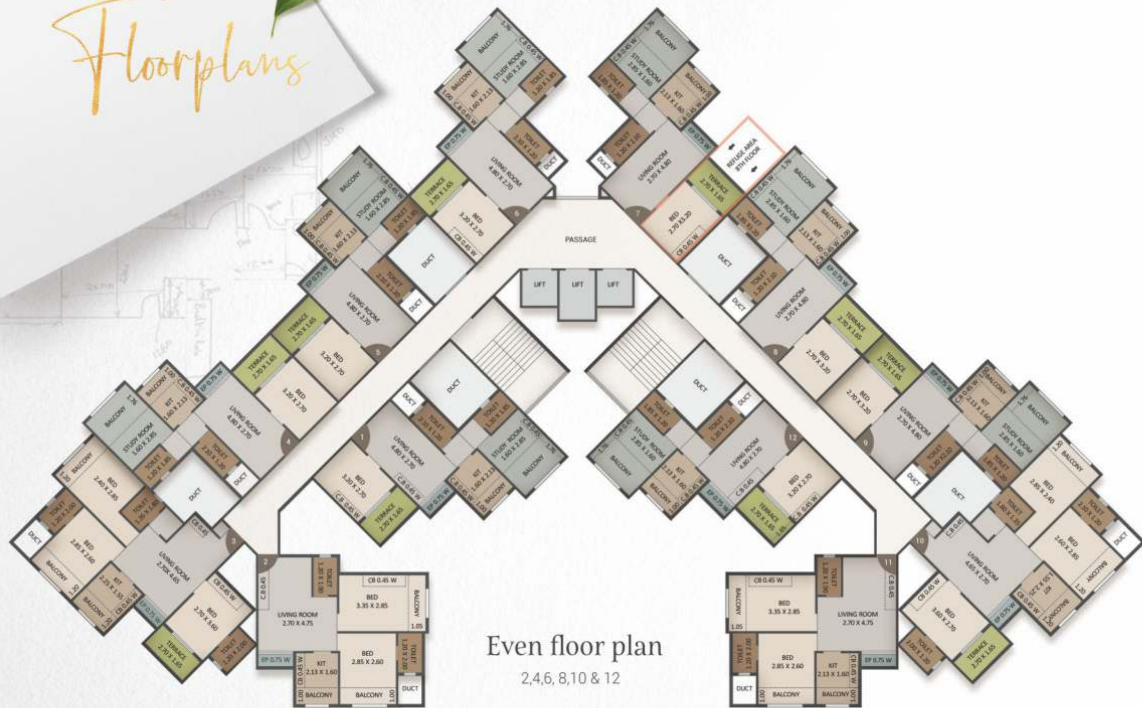
Even floor plan 2,4,6,8,10 & 12